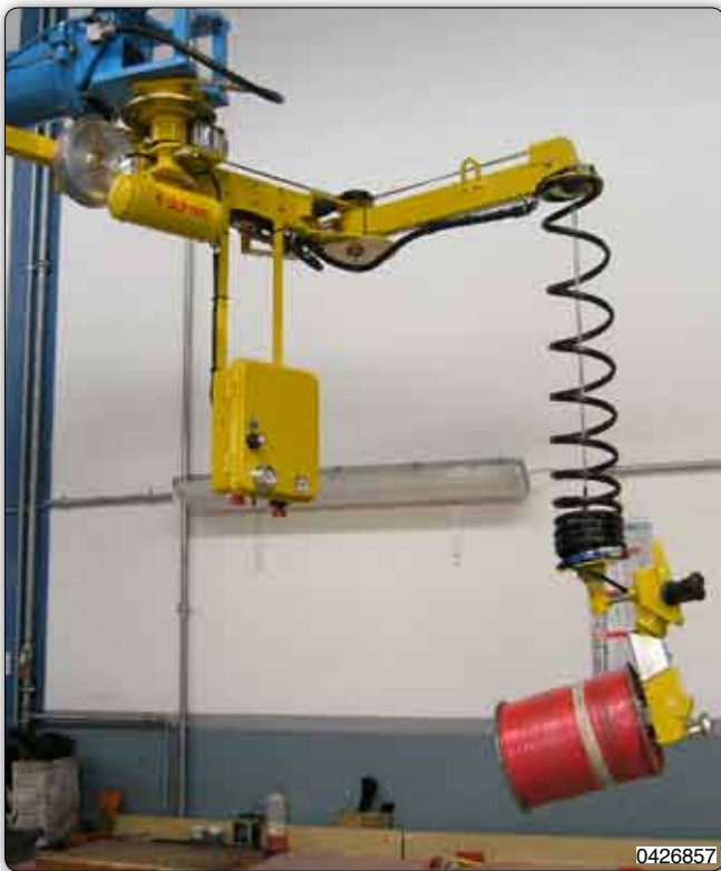
SPF type Speedyfil manipulator, fixed overhead tooling model, fitted with special tooling for picking via an expanding mandrel gripping in the core and manual inclination at 90°. The tooling design caters for automatic picking and release of the coil.