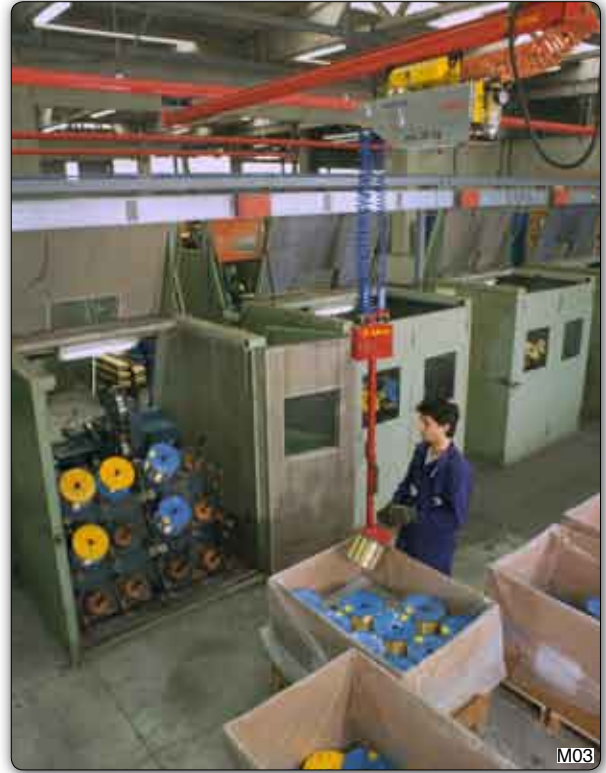
MPS type Minipartner manipulator, overhead trolley mounted version, equipped with a pneumatic gripper for picking and moving coils of B40 and B60 type steel wire. The manipulator is used to load wire which has been unwound. The tooling is made to allow threading and loading of the coils on to protruding pins.