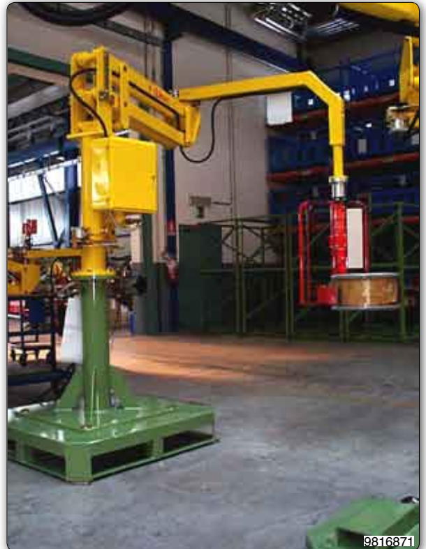
PMC type Partner manipulator, column mounted, provided with pneumatic action gripper for picking coils of wire on flanges with a pneumatic inclination of 90°.