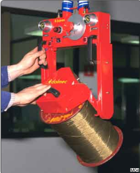
Manipulator with pneumatic gripper with double picking system for B40 - B60 and B80 coil types: with expanding mandrel acting in the internal hole and with grippers which act on the flange.