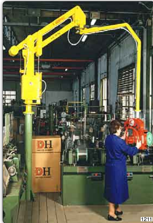
PMC type Partner manipulator, column mounted, provided with gripper tooling to pick metal coils on their central belt.