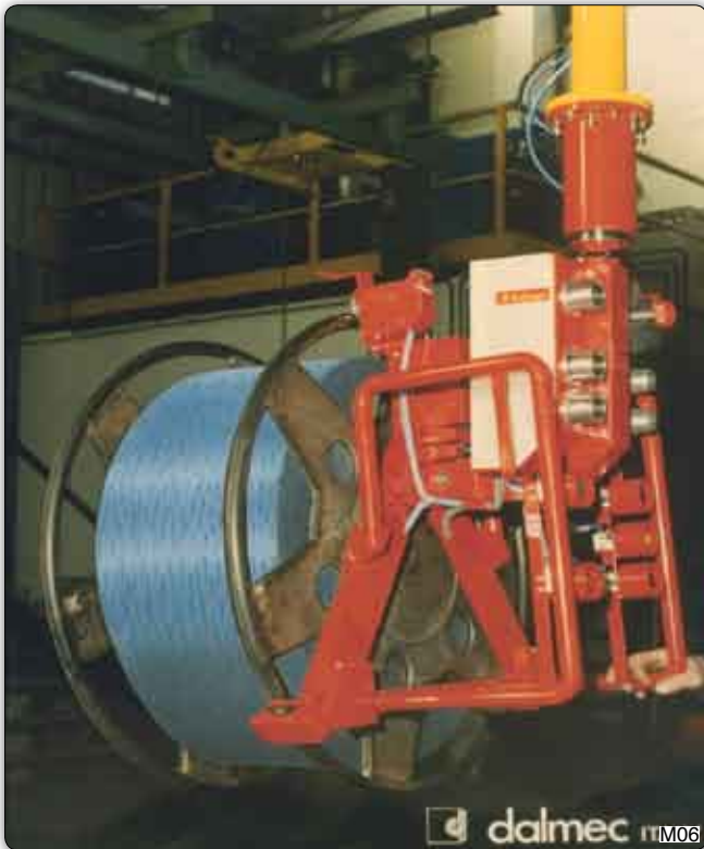
Pneumatic system for picking and moving metal coils. Picking is effected on the flange and the inclination of the coil from the horizontal to the vertical axis is obtained by means of two pneumatic pistons.