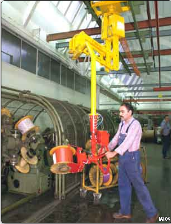
PMS type Partner manipulator, overhead trolley mounted unit, fitted with grippers for picking flanges of coils of telephone wire, suitable for moving the coils from the horizontal to the vertical axis and positioning the same in a stranding machine. Complete with tracking made by Dalmec.