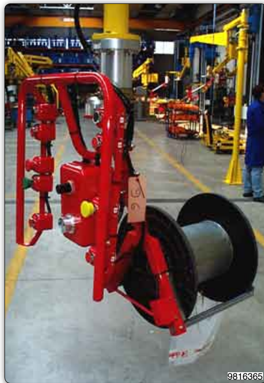
Manipulator fitted with fork-type for handling coils via the flange. Part-present sensors are fitted to the head.