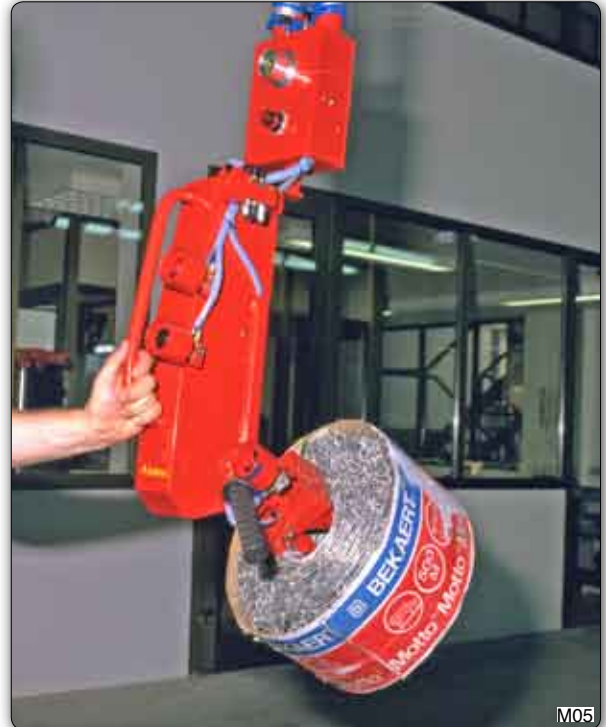
Pneumatically actuated manipulator for picking and moving rolls of barbed wire. Picking is achieved via an expanding mandrel acting in the internal hole and the 90° inclination is obtained by a pneumatic piston.