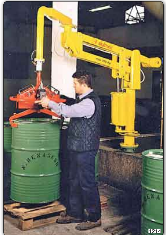
PMC type Partner manipulator, column mounted, designed for the picking and emptying of drums.