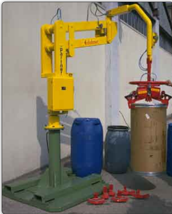
PMC type Partner manipulator, column design, equipped for picking and moving drums of varying shape and weight. Interchangeable grippers are available for handling different sizes of drums.