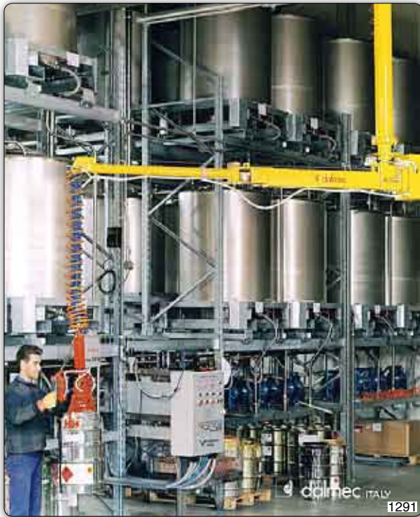
PFF type Posifil manipulator, fixed overhead version for handling metal drums.