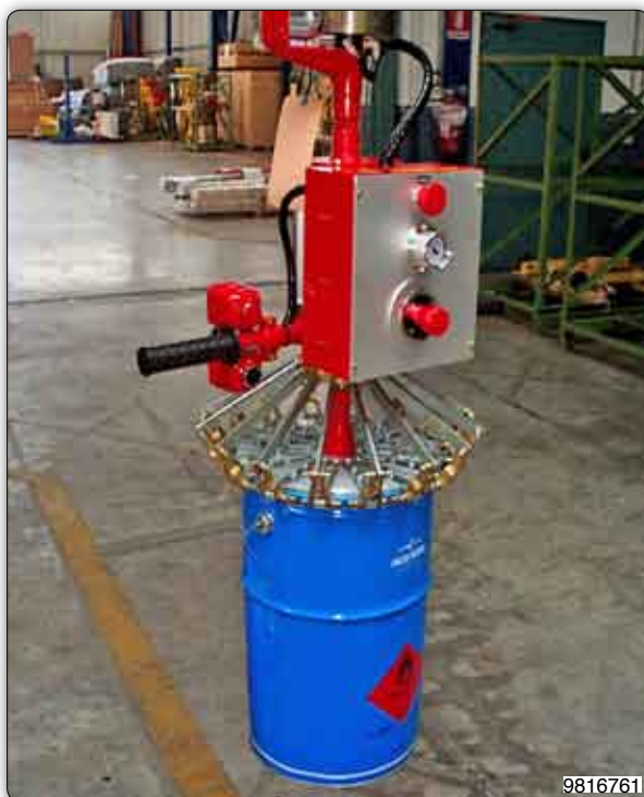
Manipulator equipped with pneumatic tooling for closing and gripping pails on the upper edge.