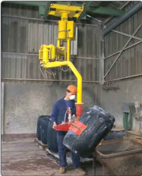
PMS type Partner manipulator, overhead trolley mounted version to cover several work stations, for handling and tipping drums.