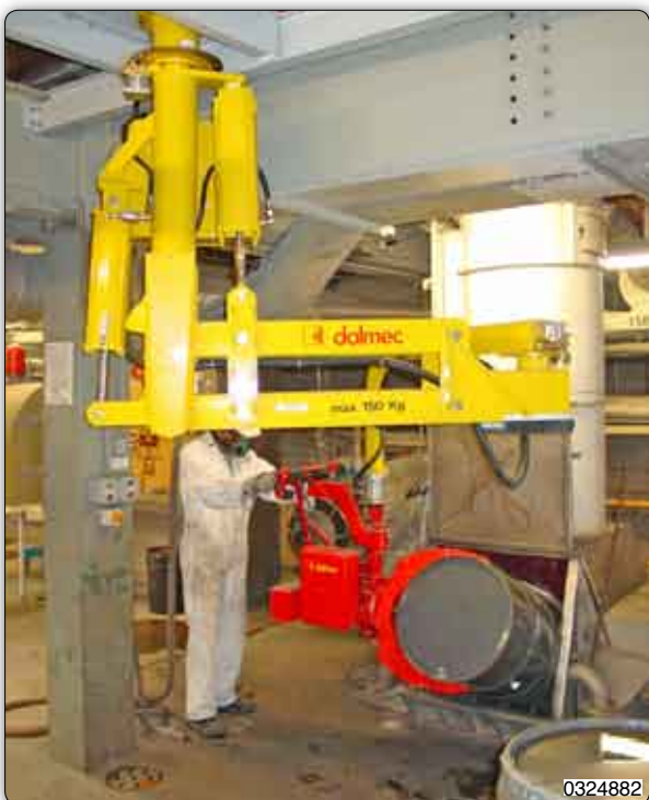
PMF type Partner manipulator, fixed overhead version, designed for the picking and emptying of drums.