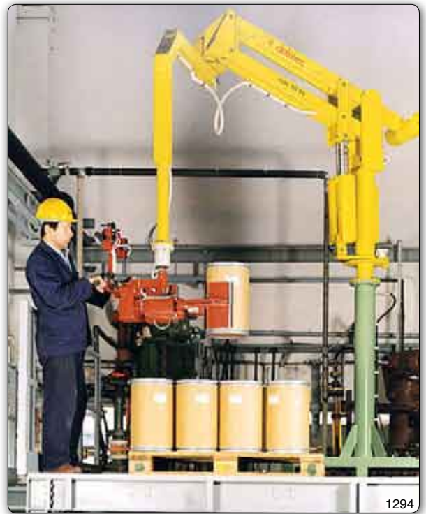
PMC type Partner manipulator, column mounted version, designed for picking and emptying carboard drums.