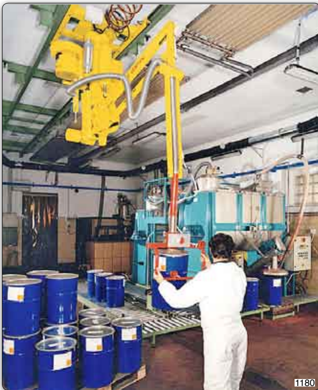
Some examples of devices for gripping and handling barrels and drums.